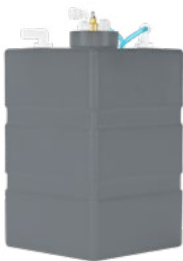
VistaCool™ Single-Autoclave Cooling System

The VistaCool™ Direct-to-Drain Cooling System protects drains by preventing autoclave wastewater from melting plumbing. It also protects cabinets by helping to prevent mildew, rot, rust and delamination caused by spills and humid environments created by autoclave condenser bottles. VistaCool™ System saves staff time by eliminating the need to empty steaming-hot water bottles manually.